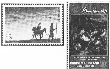
Over half of the Island's postage stamps have celebrated the birth of Christ, including The Flight into Egypt (1975).

Indigenous missions. There is virtually no missionary outreach from the Christmas Islands.