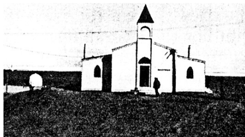
Protestants. Chapel of the Snows, used by all groups since 1958.

Human rights and freedoms. Personnel of the different nations have achieved a high level of cooperation and respect for each other and assist each other at every turn. Determination to preserve the continent from political quarrels kept relations between the USA and USSR cordial and mutually assisting throughout the Cold War, 1945-1991. This camaraderie continues throughout the 1990s.